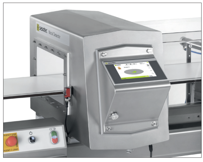
INTUITY Metal detector with highest metal detection performance and a high level of usability.

Metal detectors that are integrated in conveyor belt lines primarily are used for the incoming and outgoing inspection of packaged bulk materials and of individually packed materials. They can be combined with many types of customer-specific separating units (air blast nozzles, pusher, separating slides, ...). Complete systems — comprising conveyor belt, metal detector, and separating unit — guarantee highest operating reliability and detection accuracy.