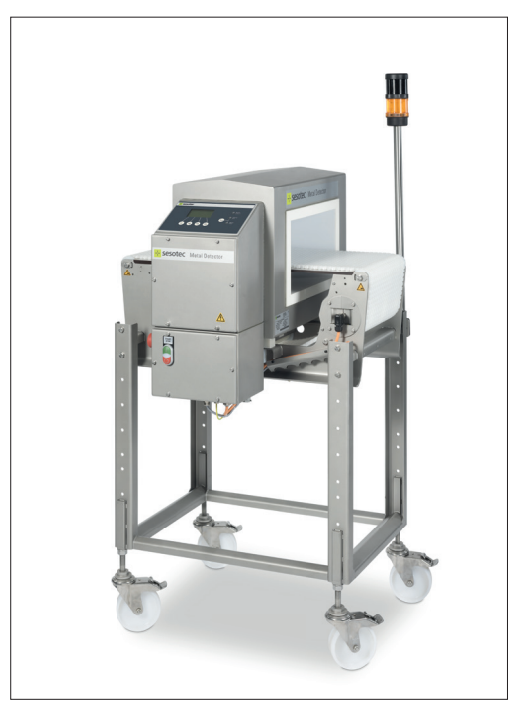
VARICON COMPACT The short metal detection system with conveyor belt and GLS metal detector.