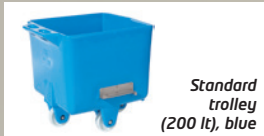
Standard trolley (200 lt), blue