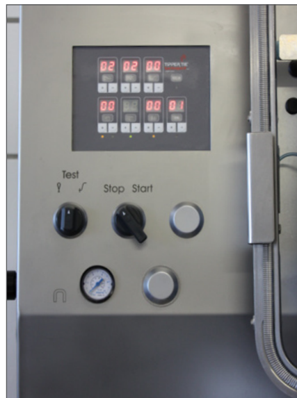
The KDCM is operated via a modern digital display.

The KDCM is operated via a digital display with 20 stored programs. This modern and easy-to-use system leaves nothing to be desired in terms of convenience, hygiene and efficiency. The user interface comprises the functions knife, loop and label counter.