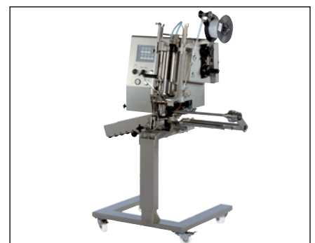
KDCM with electronic control