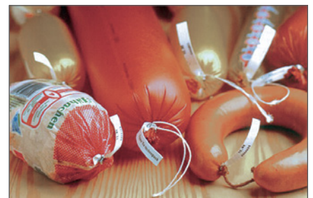
Sausages with labels and loops