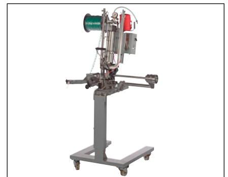
DCM with base trolley