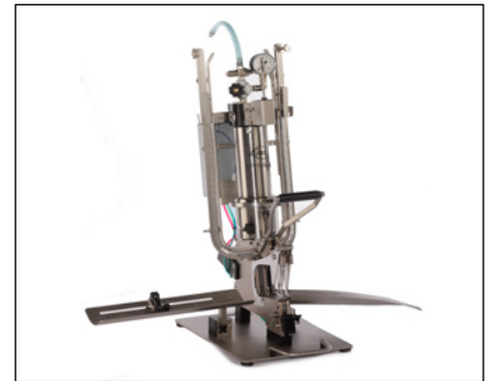
DCM with base plate