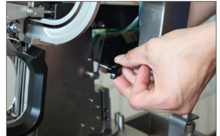
Service-friendly: knife replacement without tools